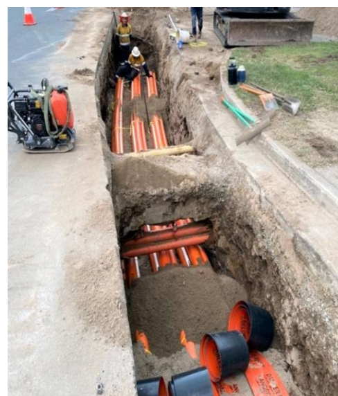
Figure 1 – A section of electrical conduit already installed adjacent to Broadwater Ave.