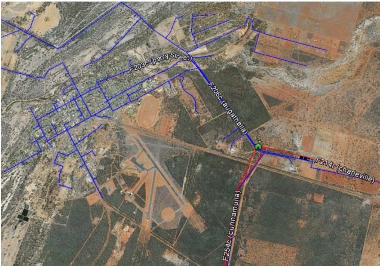
Figure 2 – Location of Charleville Substation