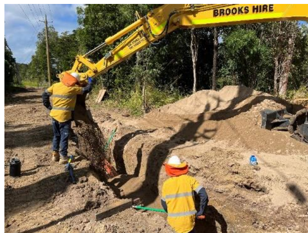
Fig 1 – Contractors installing lengths of conduit.