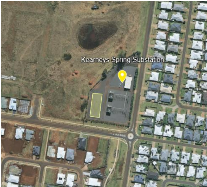
Location of the new battery at substation shown in yellow.

The battery system will be located within the Energex substation on Kearney Street, Kearneys Spring.