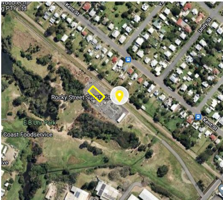
Location of the new battery within Rocky Street Substation.

The battery system will be located within the Ergon substation on Rocky Street, Maryborough.