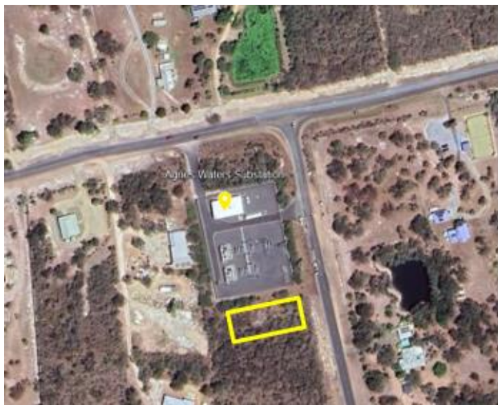
Location of the battery within the Agnes Water substation.

The battery system will be located within the Agnes Water substation on Bicentennial Drive.