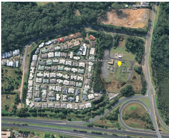
Location of the Mooloolaba substation.

The battery system will be located within the Energex substation at Power Road, Mooloolaba.