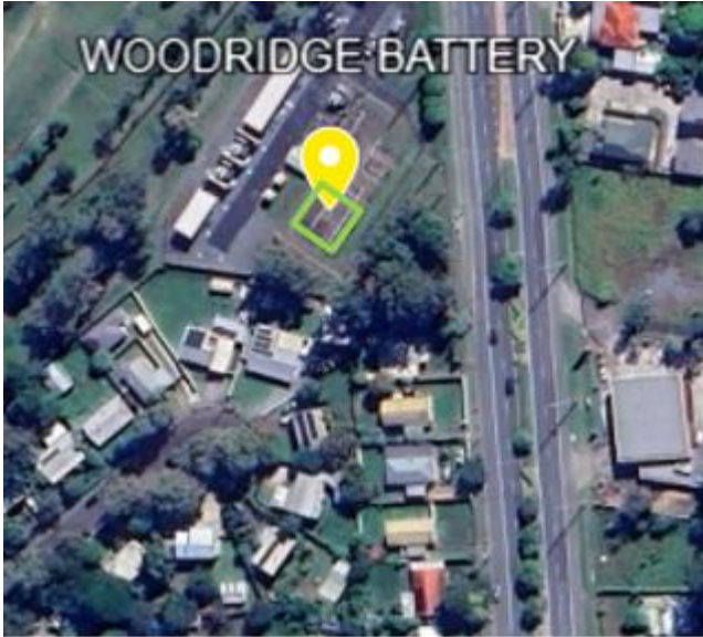
Location of the new battery adjacent to the substation.

The battery system will be located adjacent to the Woodridge substation on Kingston Road.