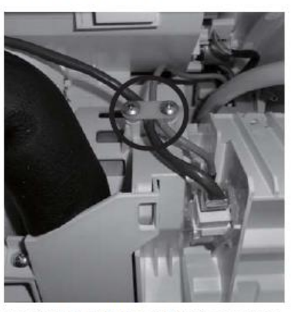
For 6.2kW, 7.0kW and 8kW is as below:

Bundle the Dred network cable at the wire-fixin hole of electric box with wire calmp . For 5.3kW is as below: