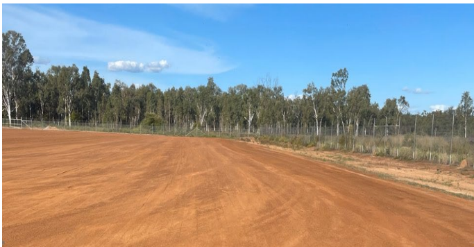
Safe tanker unloading area.

Clearing scrub for expansion work on site of existing Solar Farm