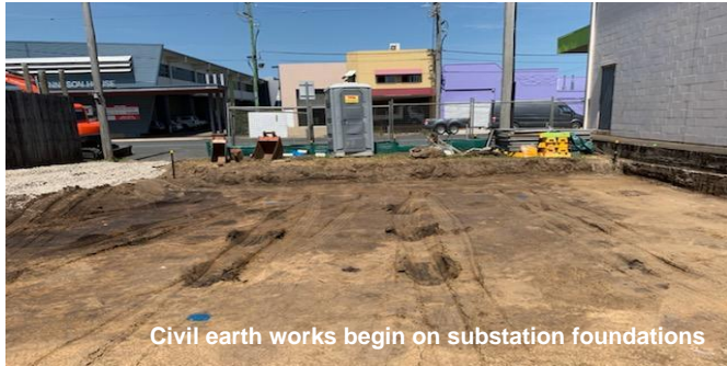
Civil earth works begin on substation foundations

These preparatory civil earth works have included levelling out the parcel of land adjacent to the existing substation where the new substation equipment will be established and laying foundations for the electrical equipment. As well, blockwork for transformer bunding has been established, communications pits have been installed and temporary fencing has been installed for safety.