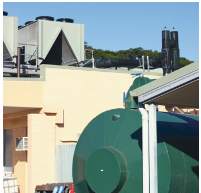
Above: Thermal Energy Storage tank (at bottom right) with air-handling units above.

The changes made to Good Shepherd's air conditioning systems mean no upgrades will be necessary—despite plans to expand the home by an extra 1,500 square metres. The cost of the building program will be less than expected because the air conditioning infrastructure is already in place.