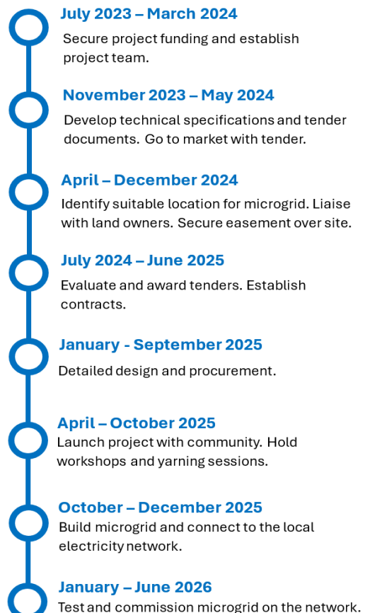
Fig 2 – Mossman Gorge Microgrid Project Timeline

We'll keep you updated on our progress and let you know when work on the microgrid is ready to start.