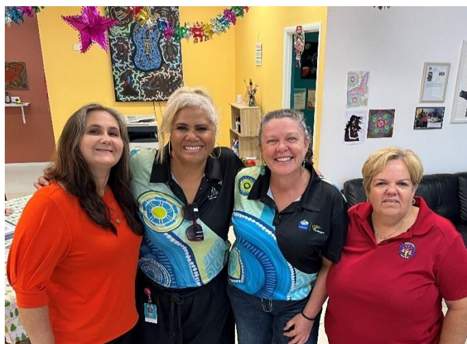
Fig 4 – Thanks to MEJG for the warm welcome and for hosting our Big Energy Yarns.

The ladies from MEJG saw an opportunity to host some of our Big Energy Yarning Sessions with their clients, to help them understand a bit more about how electricity gets to them to power their homes, which appliances and equipment cost a lot to run, and more energy efficient options.