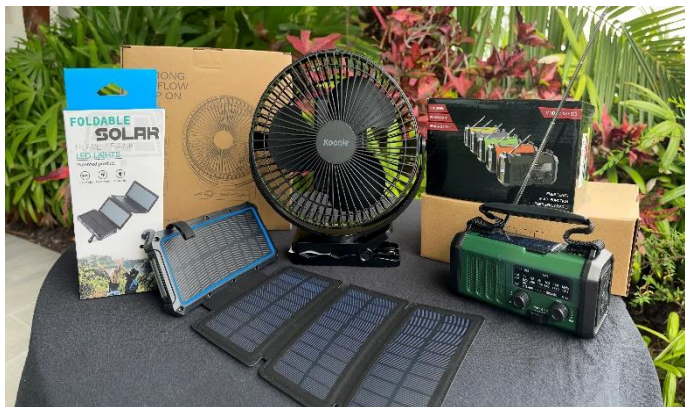
Fig 6 – You can win this deadly prize pack – simply scan the QR code and complete our short survey.

We're keen to hear what you think, so we've created a short survey to make it easy for you to have your say - and go into the draw to win this deadly prize pack - see figure 6.