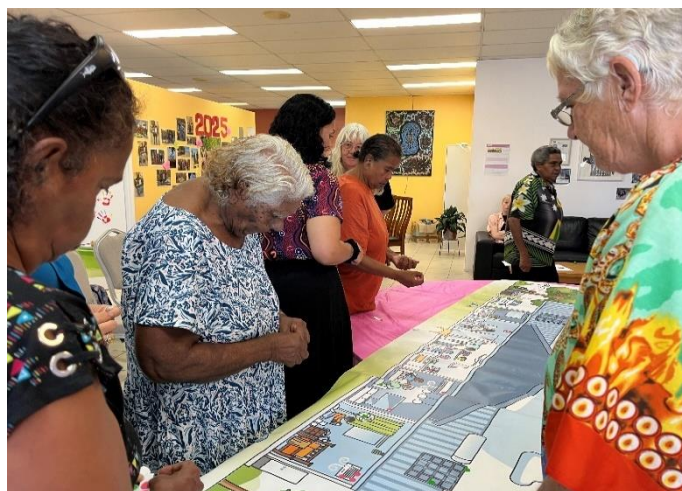
Fig 5 – MEJG's Women's Group participants joining in an energy savers activity at a recent Big Energy Yarning session.

At one of these sessions, we had a yarn with the Women's Group about the Mossman Gorge Microgrid Project as well as running an energy savers exercise – see figure 5.