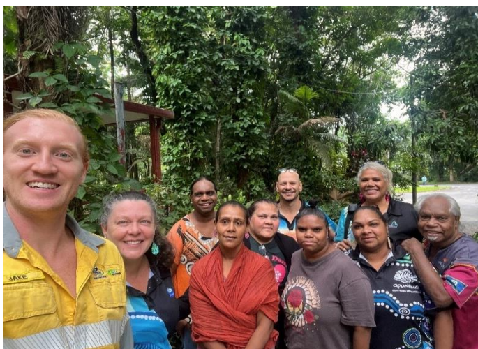
Fig 3 – Thanks to the BBN Directors and community members who helped us to plan our Mossman Gorge Big Microgrid Yarn event.

They worked hand in hand with locals to plan the recent Big Microgrid Yarn – see figure 3 – a community event to launch the project and connect with locals to yarn about their energy needs and the microgrid.