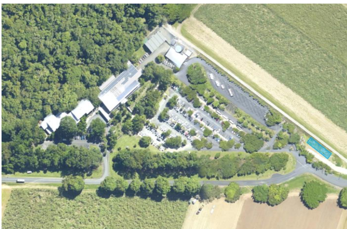
Fig 1 – Location where the Mossman Gorge Microgrid will be built at the entrance to the Mossman Gorge Cultural Centre.

We have located a suitable site adjacent to the entrance to Mossman Gorge Cultural Centre to build the new microgrid – see figure 1. The site is perfectly located close to the electricity network. The land is owned by the Indigenous Land and Sea Corporation (ILSC) who has kindly granted us an easement on the land.