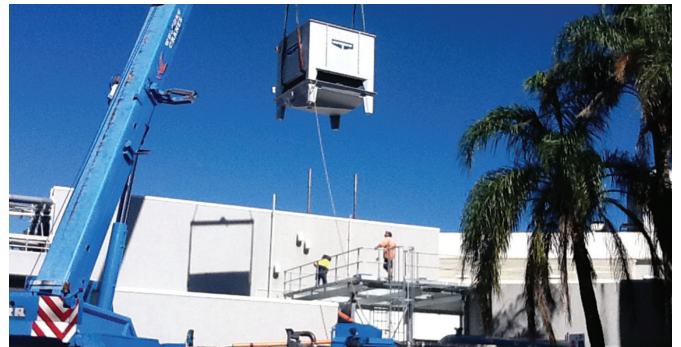
Above: Cooling Towers lifted into the new high efficiency central chiller plant constructed onsite

Six years on, Reef HQ Aquarium also installed a 205kW solar PV array - the latest rooftop addition to their suite of energy saving solutions. The aquarium has recently been recognised for its sustainability efforts and will be rewarded with cost savings well into the future.