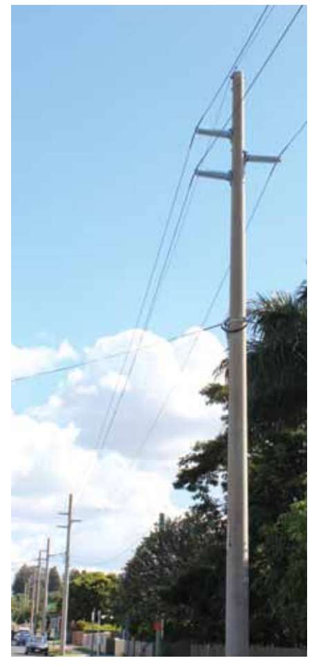
Example of a typical urban 66,000 volt concrete pole powerline

We welcome feedback from the community on suggestions to manage any potential impacts from the substation and powerline route development.