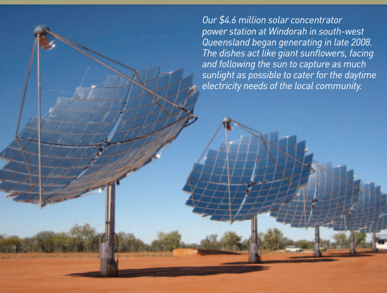
Our $4.6 million solar concentrator power station at Windorah in south-west Queensland began generating in late 2008. The dishes act like giant sunflowers, facing and following the sun to capture as much sunlight as possible to cater for the daytime electricity needs of the local community.

More details on our energy conservation efforts can be found on our online case study: Putting Our Energy into Using Less .